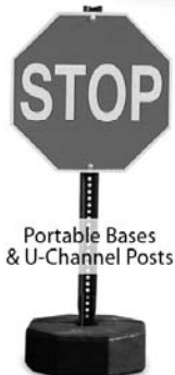
Portable Bases & U-Channel Posts